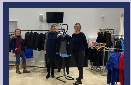
Second Hand Uniform Sale Sat 23rd March 2024, from 2pm to 4pm in the Dining Hall.

If you have any ideas for our school community and/or would like to join the team, please contact the PTA at pta@st-peters.surrey.sch.uk . Alternatively, look at our pages on the school website: St Peter's Catholic School - PTA. Other events for 2024 will be coming soon!